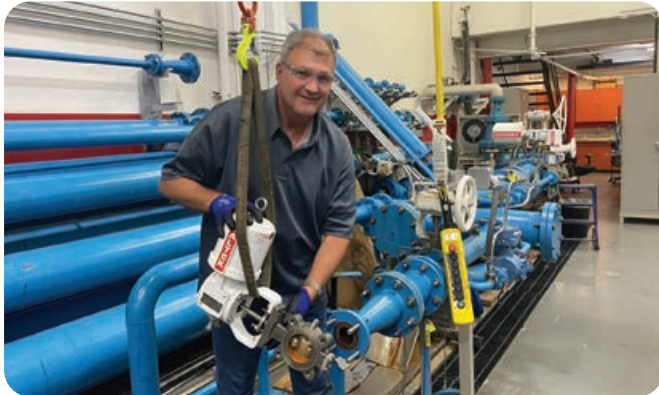
Flowserve engineers conducted numerous hours of cycle testing on the new high-cycle soft seat arrangement before finalizing the design.