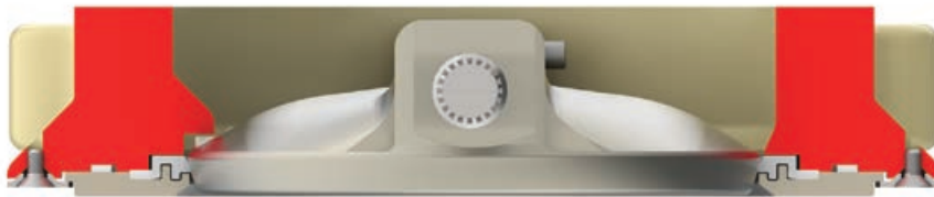
High-cycle soft seat arrangement on Valtek Valdisk valve

To ensure the valve seat works as intended, Flowserve tested it under real-world conditions to verify it can meet the cycle demands of PSA applications.