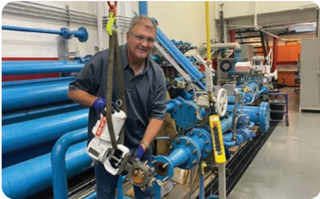
Flowserve engineers conducted numerous hours of cycle testing on the new high-cycle soft seat arrangement before finalizing the design.