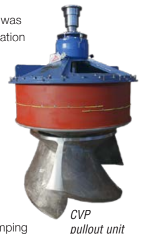
CVP pullout unit

To support the DNA project, Flowserve provided six CVP axial flow concrete volute pumps, capable of delivering 846,000 m 3 /h (141,012 m 3 /h per pump) — nearly six Olympic-sized swimming pools per minute.