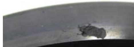
Example of a carbon blister caused by improper barrier fluid selection

While some barrier fluids are too thin to support hard vs hard seal faces and other barrier fluids cause blistering on carbon seal faces, DuraClear can support any combination of the above mentioned seal face materials under most conditions.