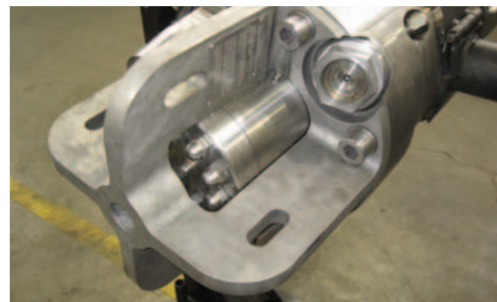
Proprietary AutoShift Decoking Tool