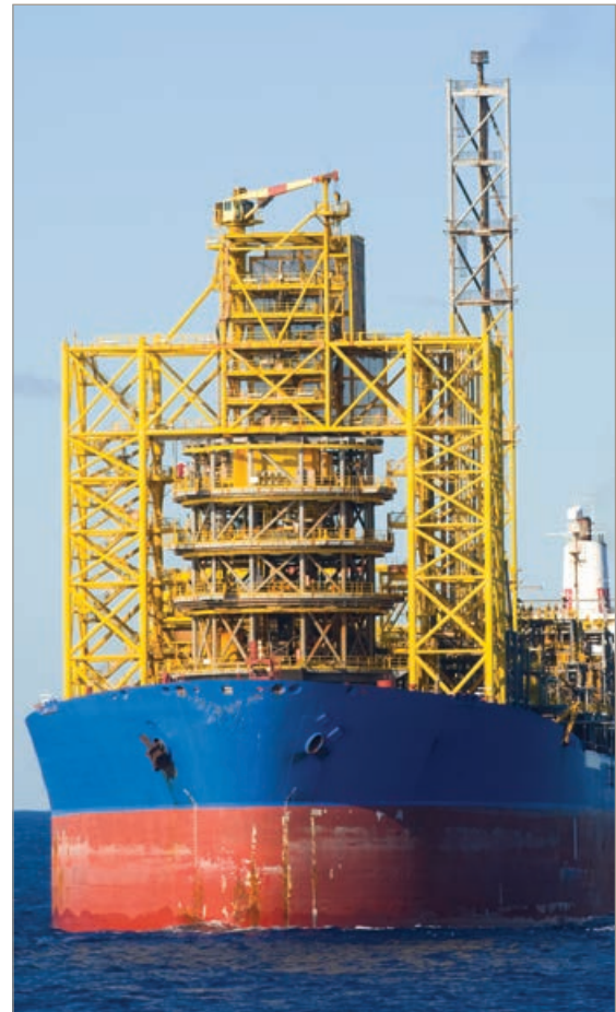
Figure 3: Typical FPSO

The custom-engineered Margherita solution revealed itself to be sufficiently innovative for immediate patenting, providing a new turnkey actuator solution where size and weight are critical considerations.