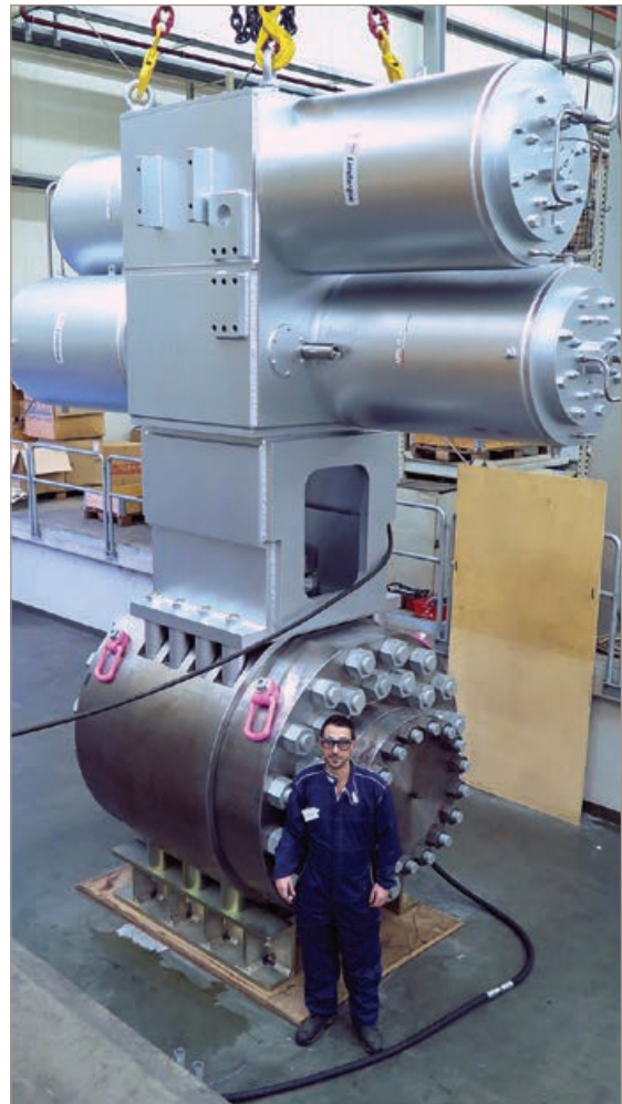
Figure 1: This custom actuator design by Limitorque saved at least 2 m (6.6 ft) and 2000 kg (4400 lb) over the originally specified unit and resulted in significant construction cost savings.

On FPSOs, hydraulic actuators are preferred to pneumatics due to their smaller power cylinders. In the case of one enormous valve specified on this FPSO, however, conventional hydraulic actuators were too large for the available space.