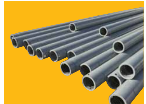
Drill Stem Assembly

Bulletin PSS-90-6.11 (E) August 2012. © 2012 Flowserve Corporation