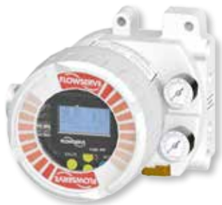
The Logix 420 allows for fast commissioning, as well as accurate and reliable control at a very competitive price.

Equipment requiring long commissioning times, unreliable control, or frequent repairs could severely impact the economic success of the enterprise. Alternatively, a product that is easy to set up, provides years of reliable service and has its own diagnostic warnings may significantly improve the financial outcome for the operation. With the Logix 420 model, you get all these features at a very competitive price.