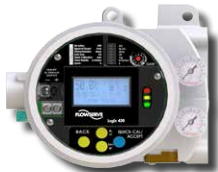
The Logix® 420 User Interface