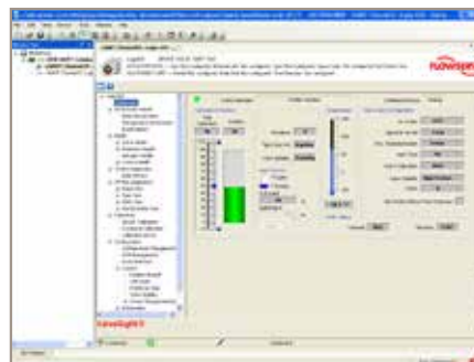
ValveSight™ DTM Software