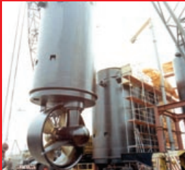
Containerized azimuthing thruster

Flowserve engineers work with customers to design the best solution for each application. Design integrity is not compromised by simply configuring standard subassemblies. In addition, several optional configurations are available, including containerized and retractable azimuthing thrusters.