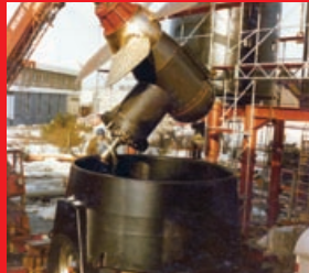
Lifetime service and support provided by Flowserve

Flowserve Type WFSD Thruster inquiries can be directed to: thruster@flowserve.com